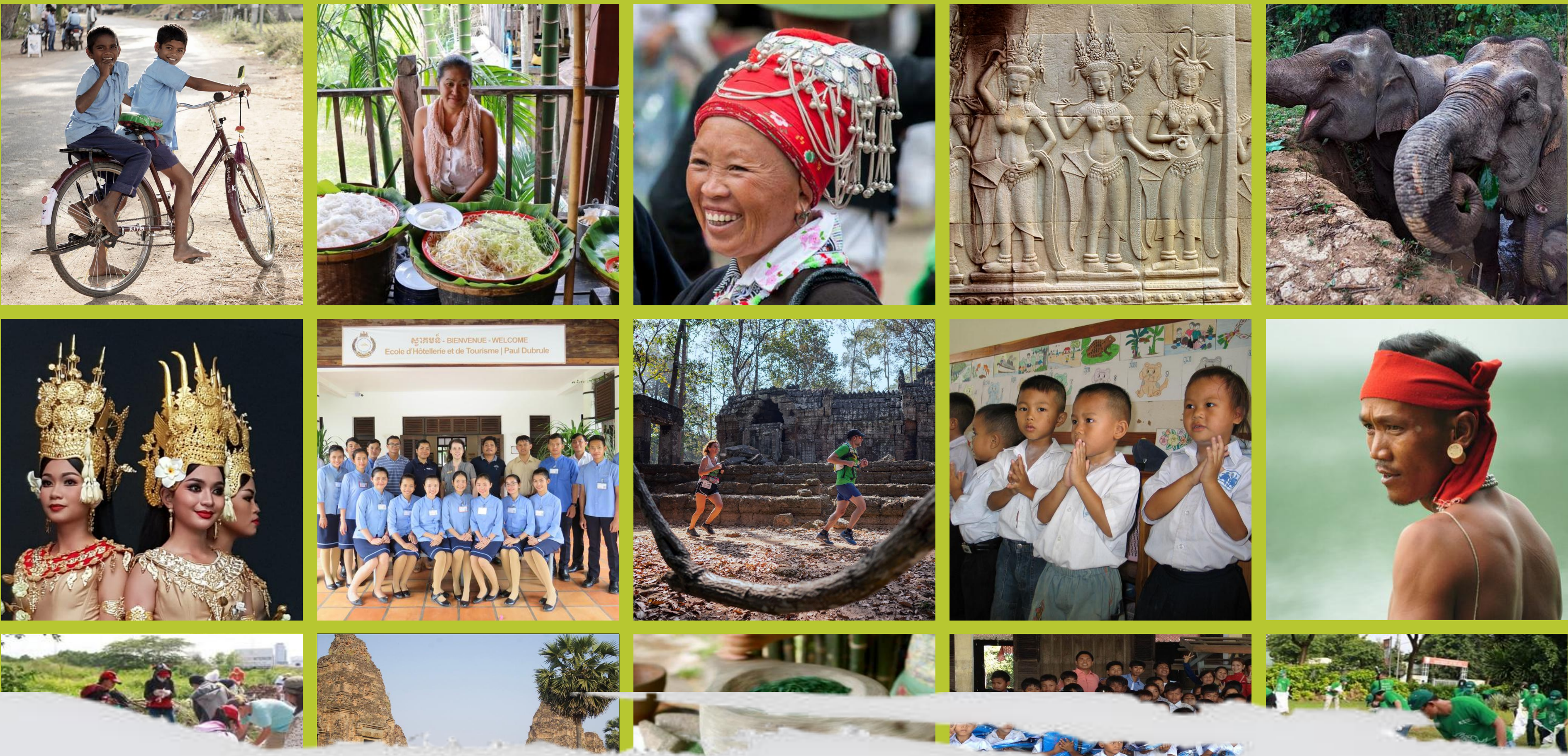
PRESENTATION OF ACTIONS AND PROJECTS SUPPORTED BY THE PHOENIX VOYAGES FOUNDATION